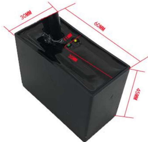
SHP300-H Boundary dimension

The overall dimension of SHP300-H is 60mm x 45mm x 30mm. The external interface is one AC / DC power input (carrier channel multiplexing), one 12V DC output and one Ethernet interface. The power input wire is about 30cm long, and the network wire and 12V DC output wire are about 30cm long.